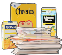
Paper and Cartons