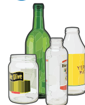
Glass Bottles and Jars (empty and dry)