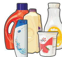
Plastic Bottles, Jars and Jugs (empty and dry)